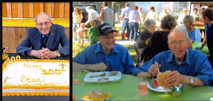
Wednesday, Jan. 21, 1998